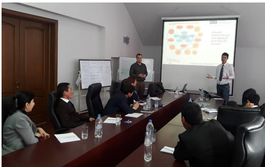
Various key stakeholders attend the education workshop to discuss opportunities and challenges of climate insurance.